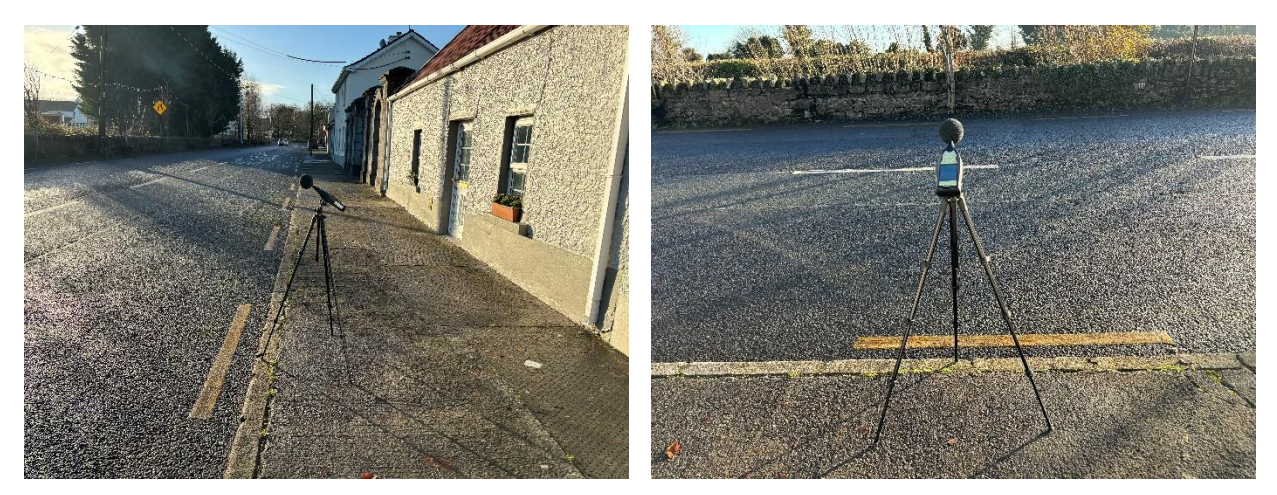
Plate 14-2: Photographs of NML2