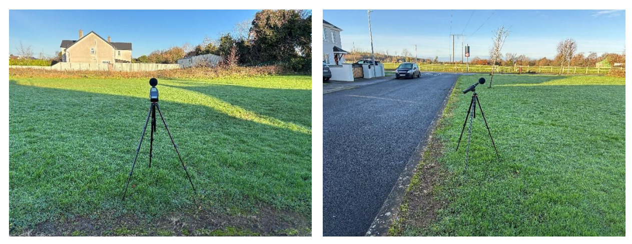
Plate 14-3: Photographs of NML3