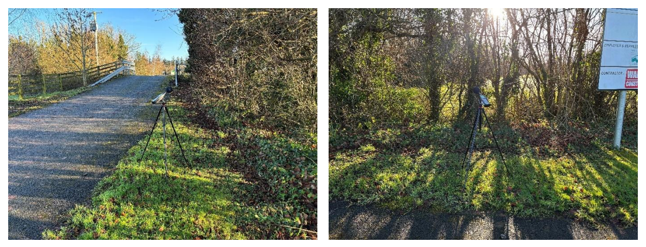
Plate 14-5: Photographs of NML5