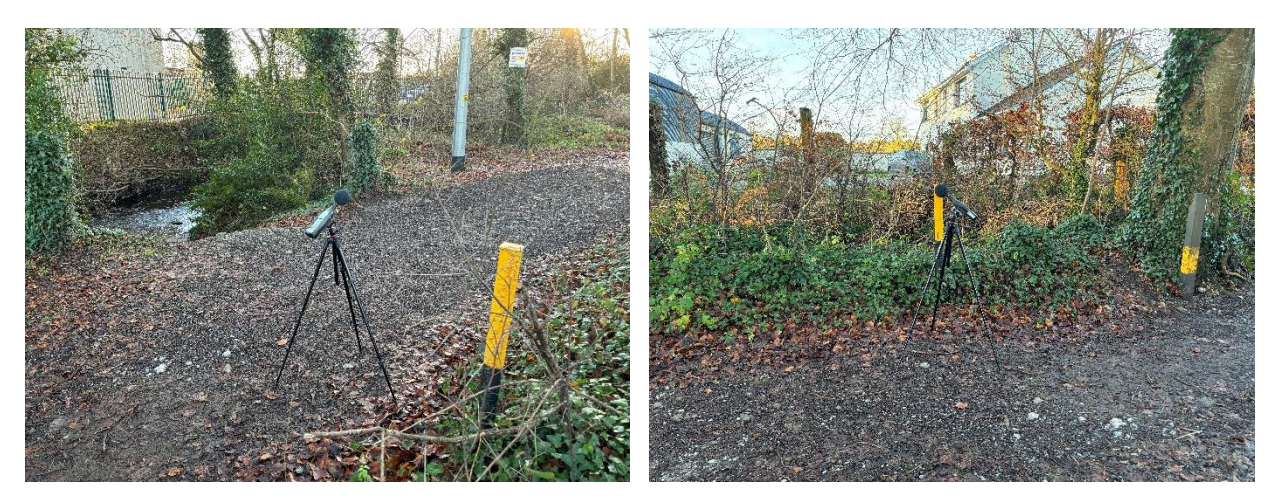
Plate 14-1: Photographs of NML1