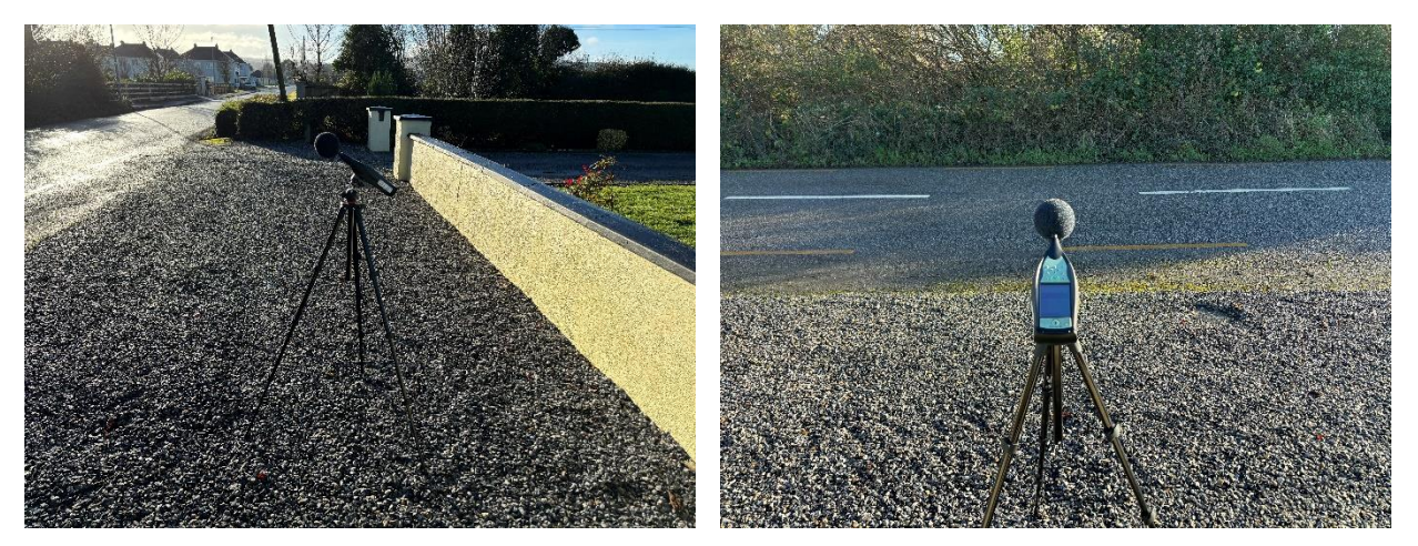
Plate 14-4: Photographs of NML4